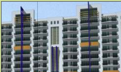
Apex Green Valley (Delivered)