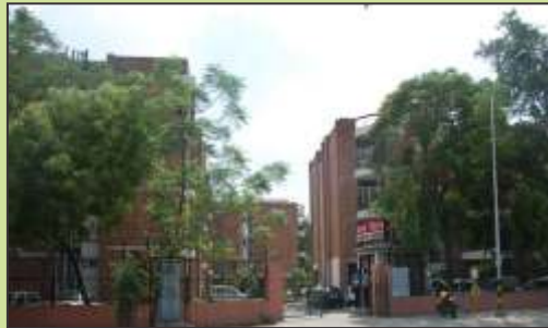
Kala Vihar Co-operative Gr. H. Society (Delivered)