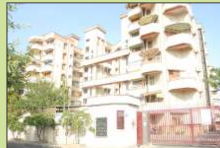
New Adarsh Apartments (Delivered)