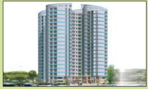
Apex Acacia Valley (Delivered)