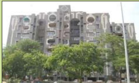
Arur Co-operative Apartments (Delivered)