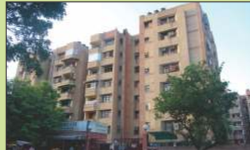
DSIDC Co-operative GHS Ltd. (Delivered Project)