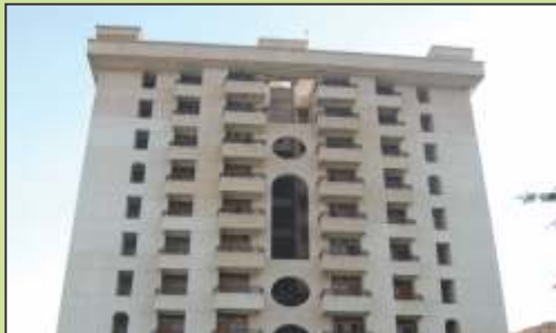
Khattar Co-operative GHS Ltd. (Delivered Project)