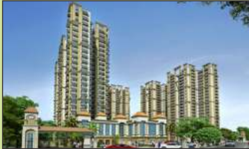
Apex Athena (Ongoing Project)