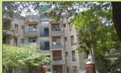
Media Times Apartments (Delivered)