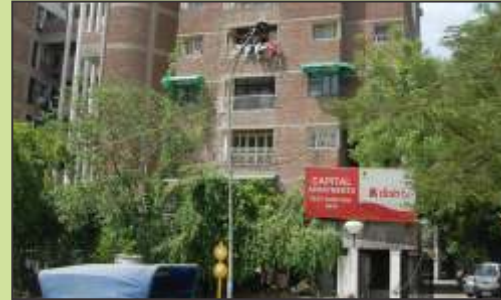
Capital Co-operative GHS Ltd. (Delivered Project)