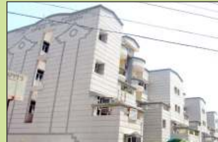
Siddha Vinayak S. S. Awas Samiti (Delivered)