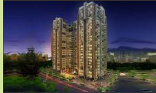
Apex The Florus (Ongoing Project)