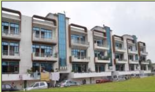
Apex Royal Castle (Delivered)