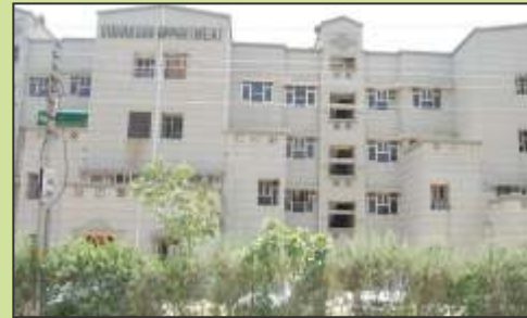
Suraksha Sehkari Awas Samiti (Delivered)