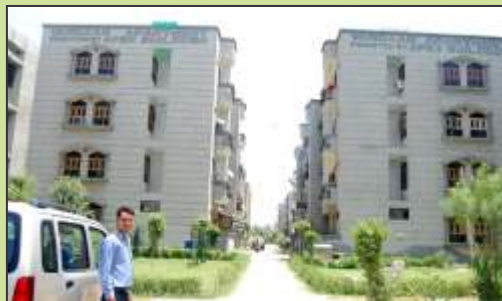
Vardan Apartments (Delivered)