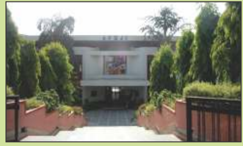
Air Force Golden Jubilee Institute (Delivered Project)