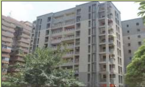
Anuradha Sehkari Awas Samiti Ltd. (Delivered Project)