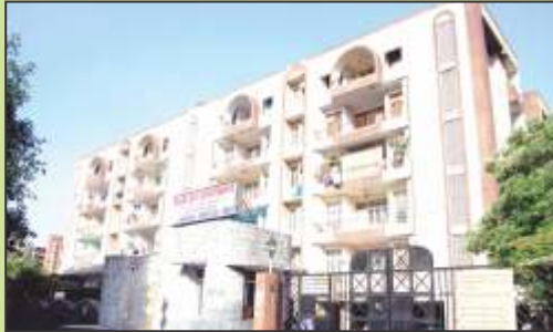
Nanda Devi Co-operative GHS Ltd. (Delivered Project)